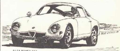
ALFA ROMEO GTZ