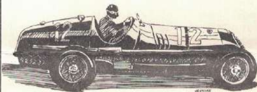
TYPE 2C-35 WINNER OF THE 1936 DONINGTON GRAND PRIX