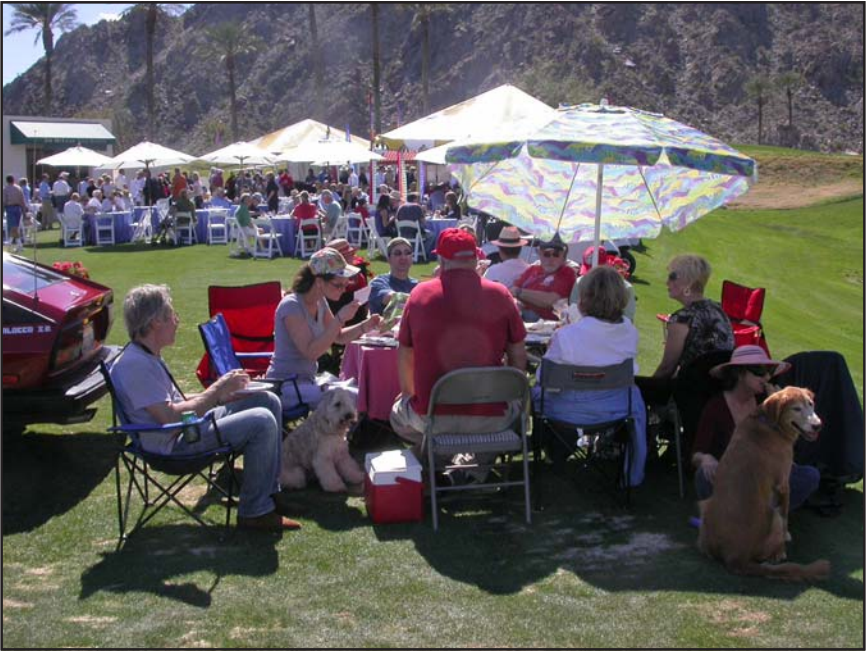
The lunch crowd desparately seeks shade on sunny Sunday.