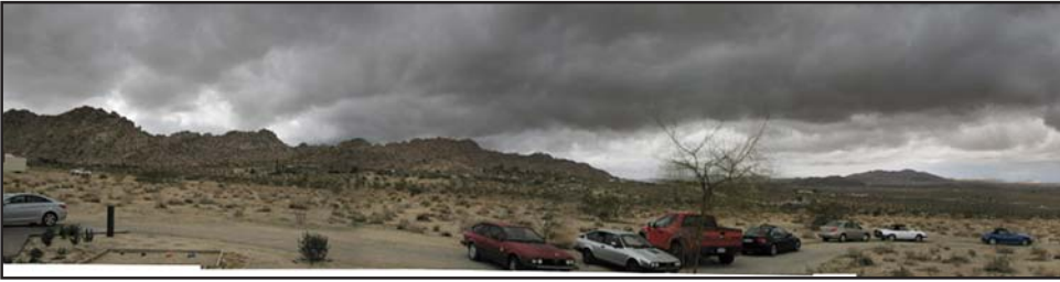
A panoramic view from Charlie & Bonnie Schwartz's home.