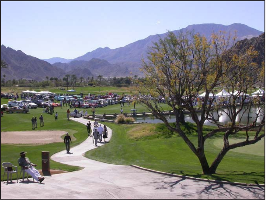
An overview of the Desert Classic.