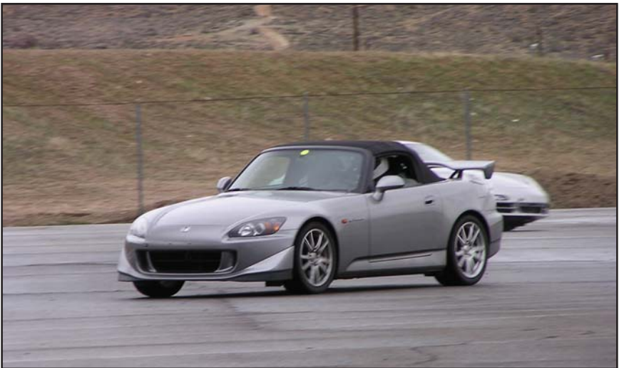
A Honda S2000 with a wing.