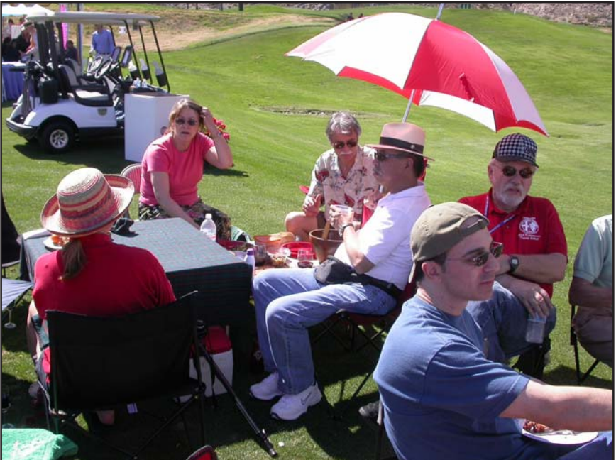
The Marque Corral lunch crowd, with improvised shade.