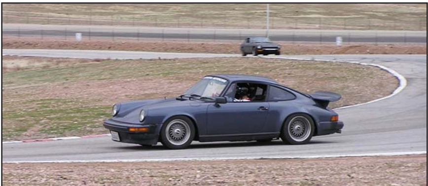
The Porsche looked better on the dry track.