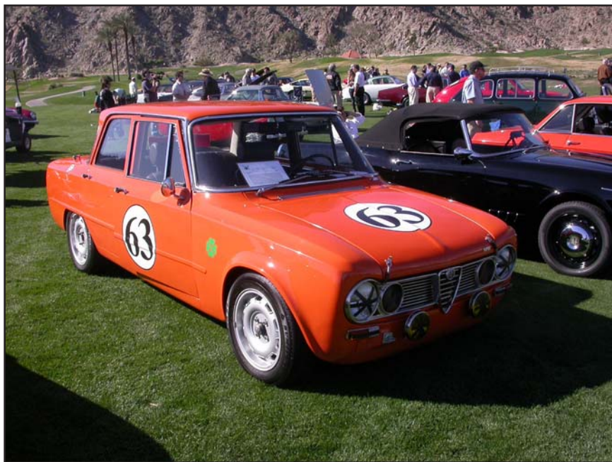
A racing Giulia TI on the green.