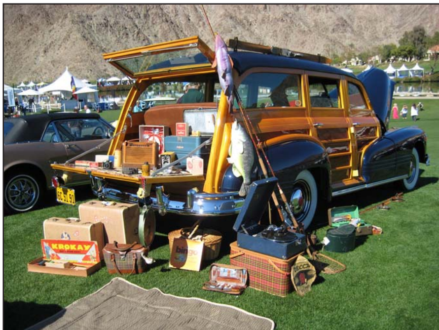
A "Woody" with all the accessories for touring and dining.