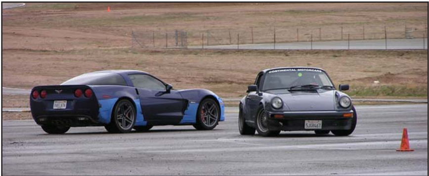
Slippery going -- a Porsche 911 spun in front of a Corvette.