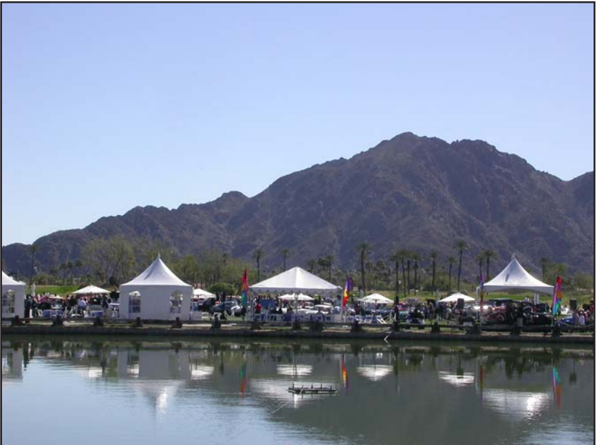
The morning gathering.