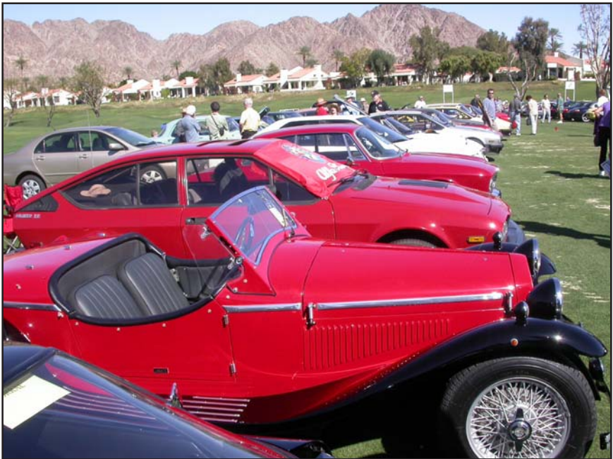
More Alfa Marque corral members.