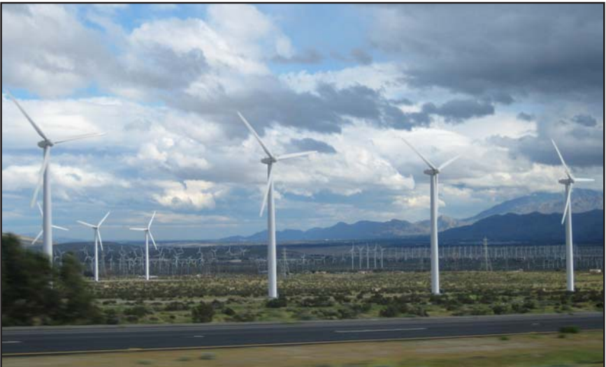
A blustery day to generate electricity from the wind!