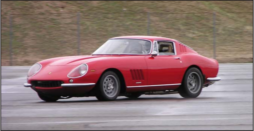
A Ferrari 275 GTV-4 ran the wet skid pad.