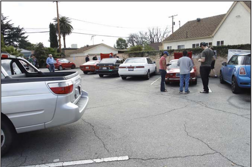
Alfas in a parking lot generate groups of Alfisti.