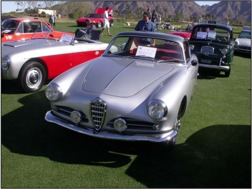
A beautiful Giulietta waits to be judged.