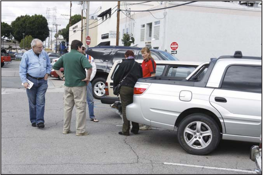
The troupes gather to chat. What is that Pick-up? Looks like a converted imported sedan.