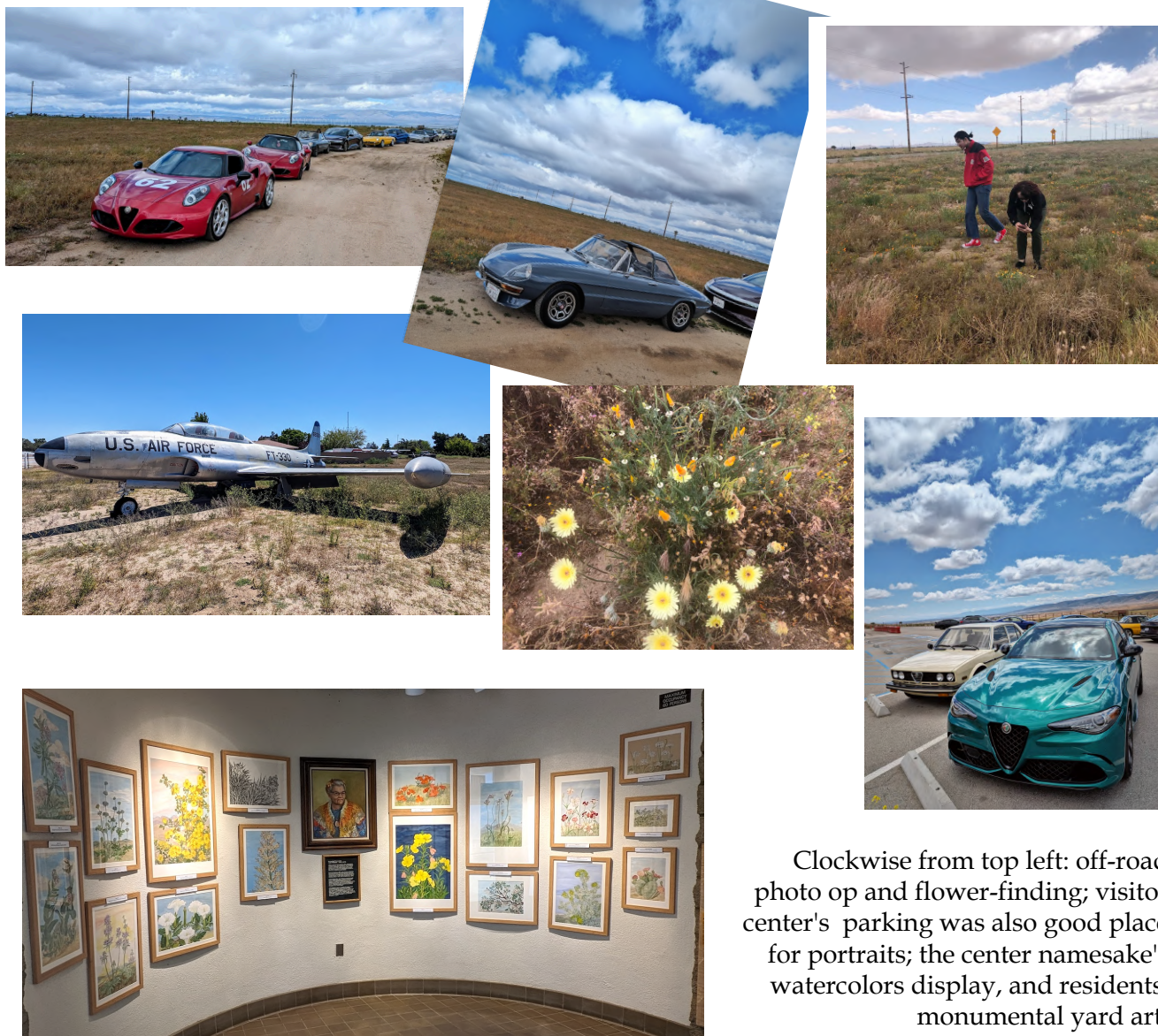
Clockwise from top left: off-road photo op and flower-finding; visitor center's parking was also good place for portraits; the center namesake's watercolors display, and residents' monumental yard art.

As we headed over the hills and down to the sprawling Antelope Valley, we were met with an expansive sky, scrubbed to a bright blue by chilly winds and filled with magnificent clouds.