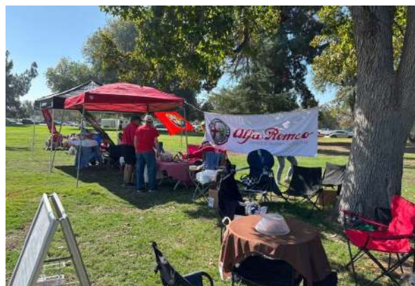
Camp AROSC in the early morning.