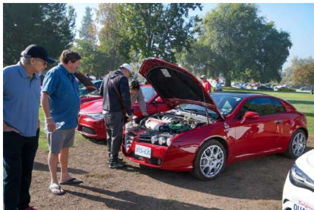
Car of the Day: Brera!